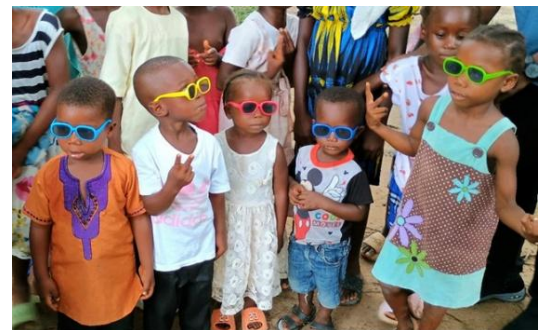
Children in Kpein